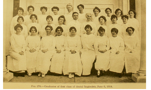
Graduates of the first class of dental hygienists, June 6, 1914. (1)